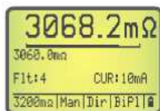
Principal measure on 3200mΩ range, in bipolar measurement mode. Filter = 4.

As seen in the pictures below all relevant information is always displayed in the 2.8-inch display, together with an indication of the range, status of Auto / Manual, Direct / Reverse measurement, Bipolar measurement, state of battery charge.